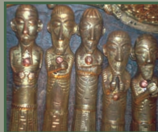
Five bronze figures each of them with a distinctive beard.