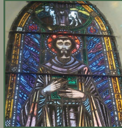
St. Monaghan Stained Glass Window, Boher Church.