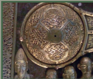
Detail of embossed cross and interlaced design.