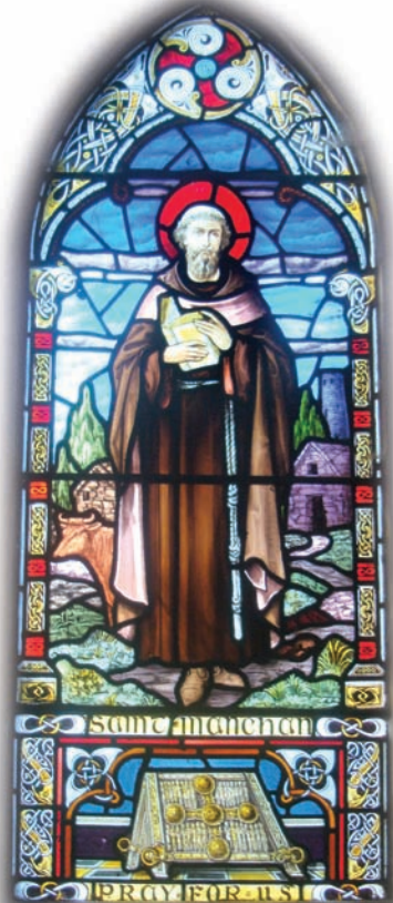
St. Monaghan Stained Glass Window in Ballinahoun Church