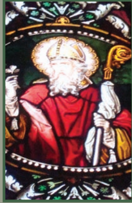
St. Patrick Stained Glass Window, Ballinahoun Church.