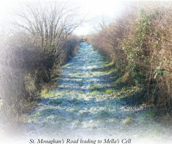
St. Monaghan's Road leading to Mella's Cell

There is no question that the construction of plank walkways in the 6th century was a response to the establishment of monastic settlements in the area