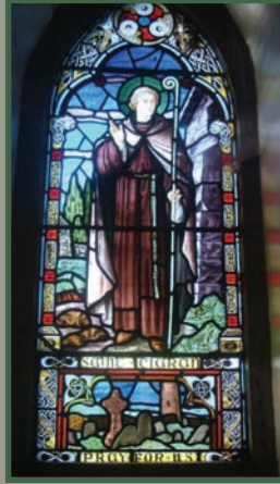
St. Ciaran Stained Glass Window, Ballinahoun Church.