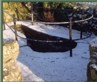
St. Monaghan's Well