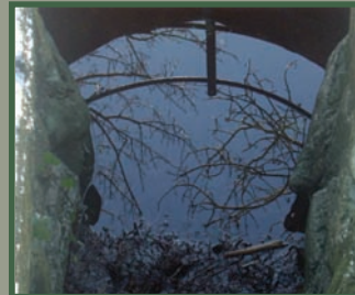
Reflections in St. Monaghan's Well