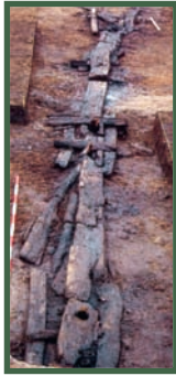
Bronze Age Plank Walkway

The classic single-plank walkway which was the favoured routeway in the Bronze Age reappeared and was commonly constructed throughout this period (AD 500–1000). After 1,000 years, very little had changed in the mode of transportation across the bog. The construction of these walkways may suggest a deterioration in weather similar to that which occurred during the Bronze Age. The bogs may have been drier in the