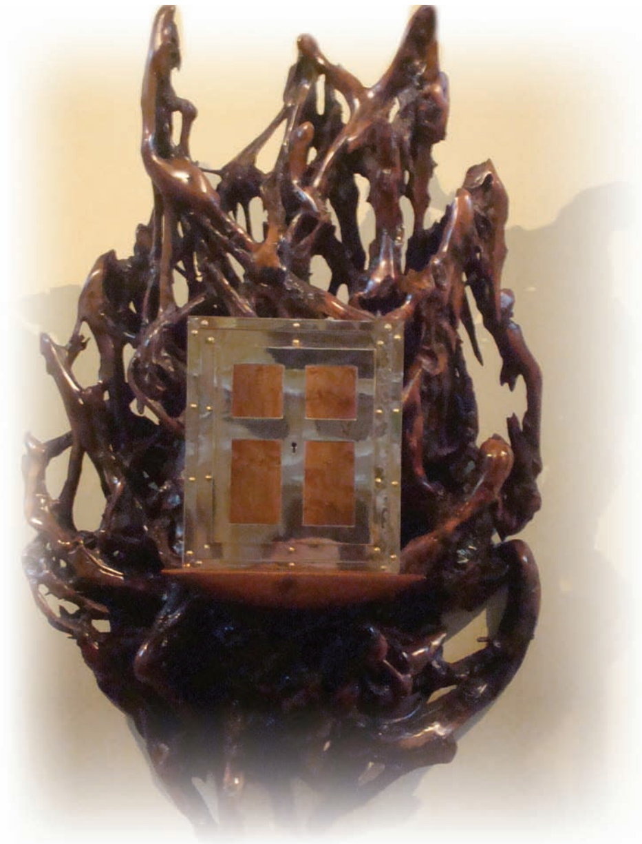
Tabernacle in Pullough Church with old bog oak encasement which attracts visitors from all over the world.