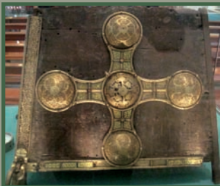
View of Shrine from back.