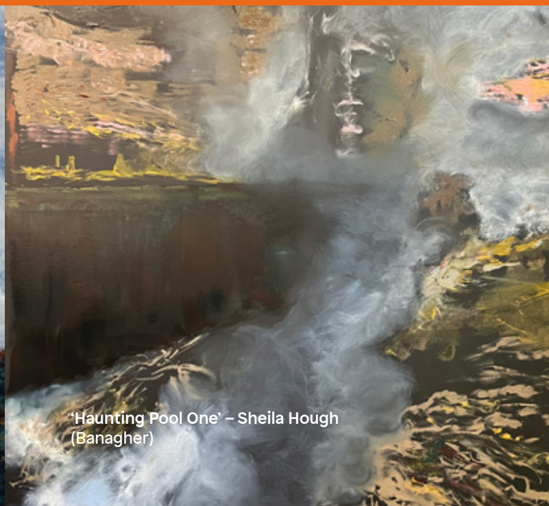
'Haunting Pool One' – Sheila Hough (Banagher)