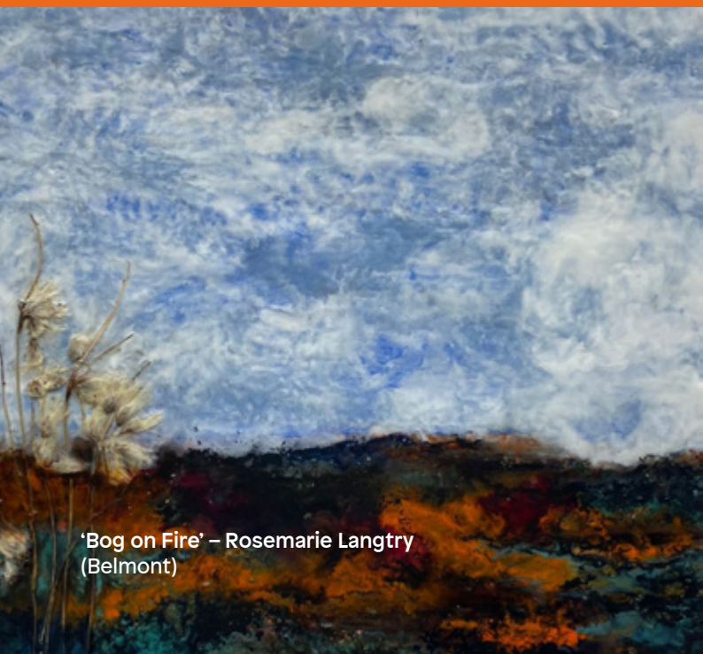
'Bog on Fire' – Rosemarie Langtry (Belmont)