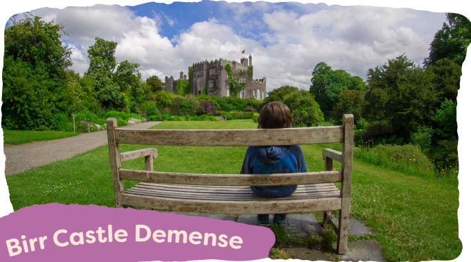
Birr Castle Demense

Something for everyone at Birr Castle Demesne with 50 hectares of parklands, 10km walking trails, formal gardens, waterfalls, rivers and lakes. Home to the great telescope and science centre. For the little ones, check out Ireland's largest tree house, the solar trail and the tree trail specially designed for children. Take a guided tour or explore on your own - it's up to you! Castle tours also available in season.