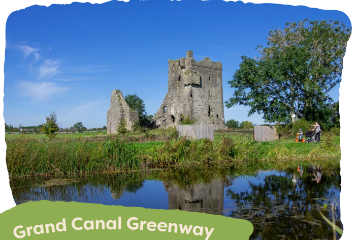
Grand Canal Greenway

Stroll or cycle along the Grand Canal Greenway. There's a total of 52km of off road towpath trails, extending east and west. Take 10 minutes or make a day of it and cycle to Lough Boora Discovery Park or Edenderry !