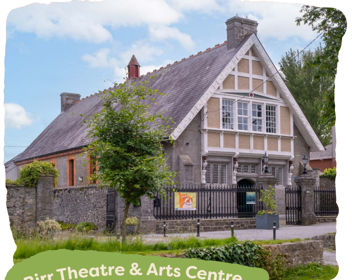
Birr Theatre & Arts Centre

Stay in one of our friendly family run hotels in the heart of this beautiful heritage town: Dooly's Boutique Hotel or the four star County Arms Hotel . For a more intimate feel, experience true Irish comfort in the award winning Ardmore Country House , Kinnitty.