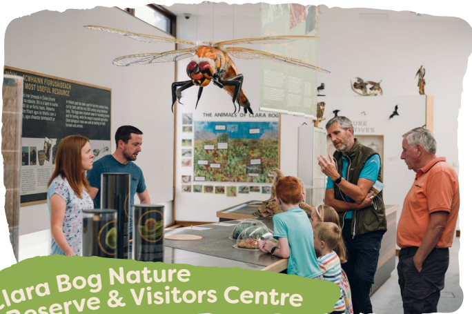
Clara Bog Nature Reserve & Visitors Centre

Stroll the 1km looped boardwalk of Clara Bog Nature Reserve and experience nature at its best. Learn more about the history of one of the finest examples of a raised bog in Ireland and its many protected wildlife species at its visitors centre.