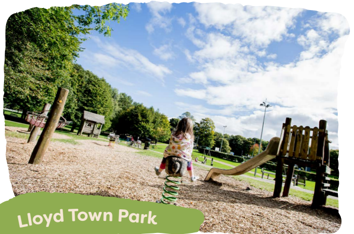
Lloyd Town Park

Wander this magnificent town park nestled between the bustling streets. With a playground, water feature, outdoor gym, and basketball court, there's something for everyone!