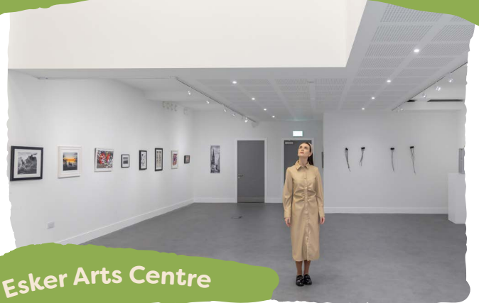
Esker Arts Centre

Experience fine dining in The Blue Apron , Italian favourites at Balcone Italiano , Siroccos , Mezzos , Pizzeria del Capitano ; Eastern flavours at Lana , Shishir , Chanapa Thai , or enjoy modern Irish at Brownes the Venue and The Old Warehouse .