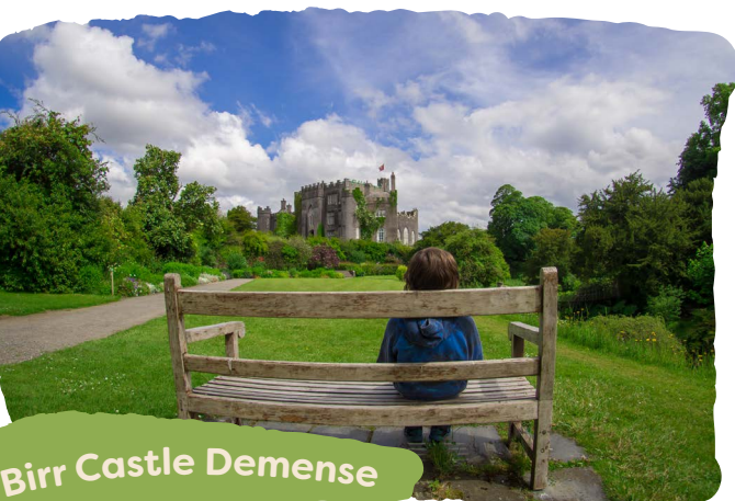
Birr Castle Demense

Lunch in the quaint village of Kinnitty in the foothills of the mountains. Peavoy's Café serves delicious light lunches and treats or dine in style in Kinnitty Castle or outside in it's Monk's Café.