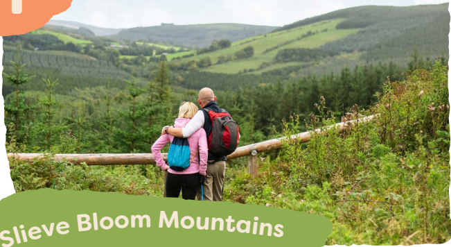
Slieve Bloom Mountains

Discover the undiscovered Slieve Bloom mountains! With a choice of 21 marked routes to choose from ranging in length from 1 hour to 4 hours and varying degrees of difficulty. For the more adventurous, take to the mountain bike trails and explore over 60km of trails.