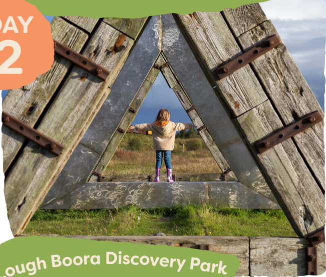
Lough Boora Discovery Park

Explore the wonders of this unique 2,000 hectare park. Not only does it boast 50km off road walking and cycling trails, it has a fantastic sculpture park, fairy trail, lakes, sensory garden, and open parkland filled with interesting flora and fauna, allowing you to reconnect with nature.