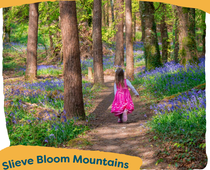
Slieve Bloom Mountains

The Slieve Bloom mountains offers an abundance of looped walking trails and mountain bike trails for all abilities. Start out in Kinnitty where you can choose either activity or just enjoy the quaint village with a snack in Peavoy's coffee shop or a cuppa at the Castle! Check out the unique pyramid in Kinnitty too, an exact replica of the Egyptian pyramid of Cheops!