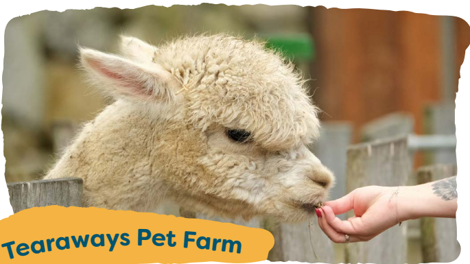
Tearaways Pet Farm

Get up close and personal with the animals at Tearaways. Enjoy the outdoor playground, go-cart track, sports pitches and let loose in the indoor soft play area. Mums and dads can grab a cuppa in the onsite coffee shop.