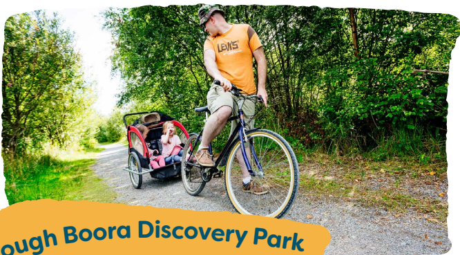
Lough Boora Discovery Park

Explore the wonders of this unique 2,000 hectare park. Not only does it boast 50km off road walking and cycling trails, it has a fantastic sculpture park, fairy trail, lakes, sensory garden, and open parkland filled with interesting flora and fauna, allowing you to reconnect with nature.