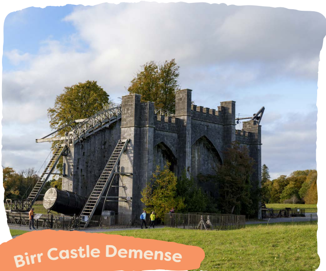
Birr Castle Demense

Take your pick from several lovely eateries and coffee shops in Birr: Emma's Café , Kelly's Bar , The Thatch , Woodfield Café , The Stables .