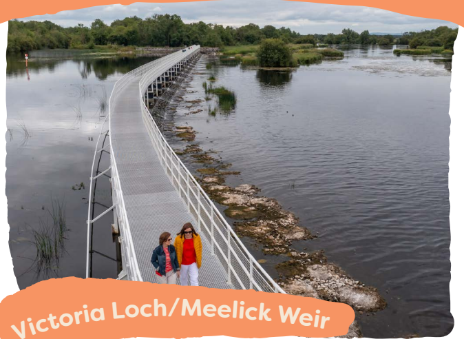
Victoria Loch/Meelick Weir

A half hour from Birr will have you transported to the historic Meelick Wier on the River Shannon. Originally built in the 1840's the weir has been recently restored and spans over 300m across the mighty Shannon. The adjacent Victoria Lock, also from the 1840's, is of great architectural and technical interest.