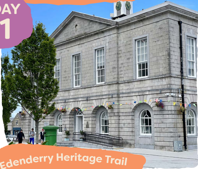
Edenderry Heritage Trail

Explore the historic town of Edenderry with the free downloadable audio guide that leads you through all the sites of this picturesque town.