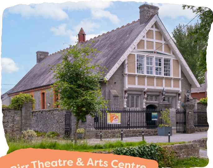
Birr Theatre & Arts Centre

Soak up the culture at this historic theatre dating back to 1888. With concerts, shows, films, exhibitions or even one of Birr's renowned festival events.