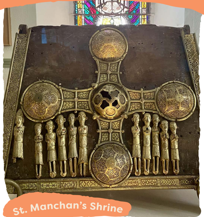
St. Manchan's Shrine

Boher's Roman Catholic Church has a most extraordinary shrine associated with St. Manchan of Lemanaghan on permanent public display. The shrine is a 12th century gabled box of yew wood and bronze, which contains the relics of the Saint himself.